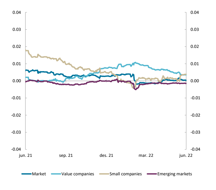
Chart 1. Factor exposures of the fund's equity management relative to benchmark. Coefficients

Norges Bank Investment Management measures the fund's exposure to various systematic risk factors such as small companies, value stocks and bonds with credit premiums. Risk factors capture common variations in returns of securities with similar characteristics and contribute to both the risk and the return of the investments. Exposure to these factors can be estimated using the co-movement of the fund's historical relative return with the historical returns of the factors.